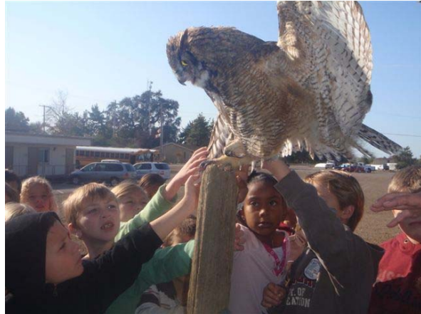
Hootie gets up close and personal with the students!

The Butte County Conservation Partnership Office participated at the annual Kid's Day on the Farm, a component of the Butte County Farm City Celebrations. The Annual Farm City Celebrations are co-hosted by California Women for Agriculture. CWA invited over 300 local 3 rd graders to the CSU, Chico University Farm for a day of hands on agricultural learning. Touch is so important!