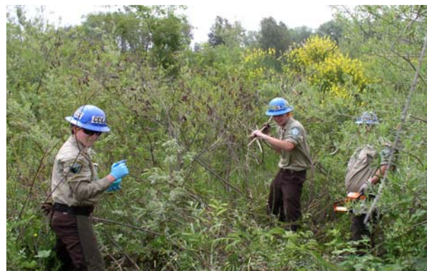
CCC remove red sesbania

The Glenn County RCD is developing the new Glenn County Certified Farmers' Market. Glenn County RCD is preparing for this years market season and is now taking applications from existing and new vendors. For more information or to participate in this exciting new venue visit www.glenncountyrcd.org