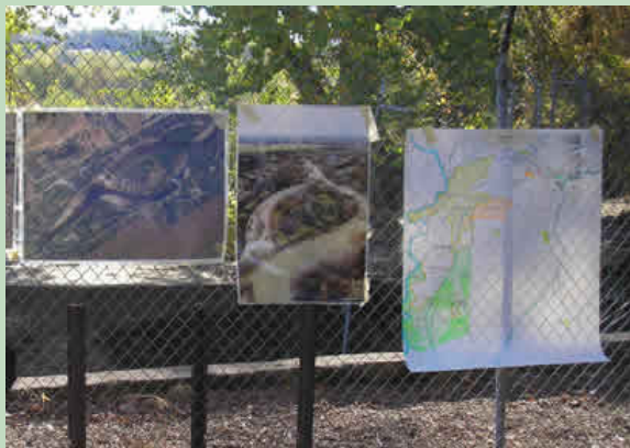
Planning for the Future

The plan is available at: http://www.buttecountyrcd.org