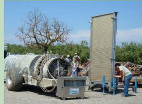
Orchard Sprayer Calibration Equipment

December 15: Growers Meeting, 8:30 am to Noon at the CSU Chico Farm, 311 Nicholas Schouten Ln., Chico (Information only, no demonstration).